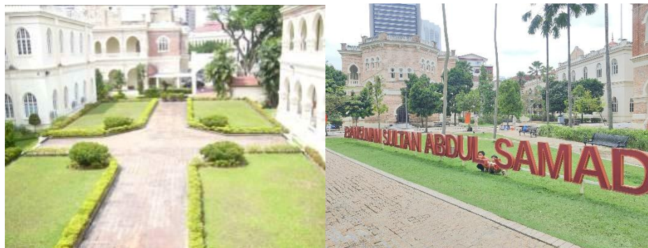
Figure 6. Courtyard area at Bangunan Sultan Abdul Samad.

Moorish architecture frequently integrates central courtyards and gardens, commonly referred to as "patios" or "courts". These outdoor areas are specifically planned to offer shelter from the sun and lower temperatures in the arid Mediterranean region. Additionally, they are frequently embellished with decorative water features, such as fountains and pools, as well as abundant plant life. (Figure 6)