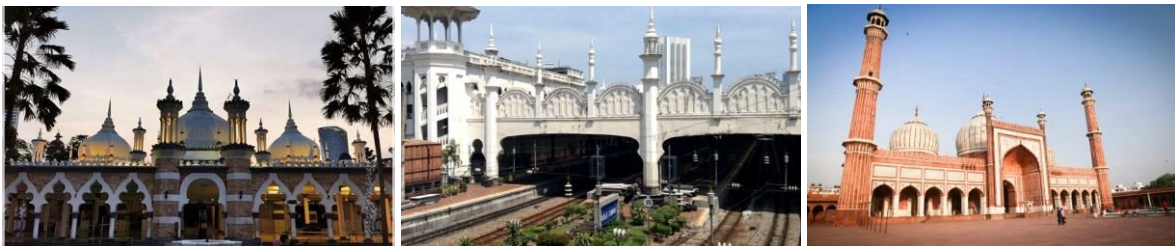
Figure 18. Turrets at Jamek Mosque, Kuala Lumpur and KTM Station Kuala Lumpur and Jama Masjid in Delhi

Turrets are utilized in Mughal architecture to produce a sense of harmony and balance for aesthetic equilibrium. They provide a pleasing aesthetic contrast by adding vertical components to buildings' horizontal layouts. The whole composition of the architectural structure depends on this balance. Some turrets may have also had tactical functions, according to strategy. They might have contained tiny cannons or rifles for defense, or they might have served as lookout positions for guards to keep an eye on the area. (Figure 18).