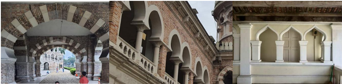
Figure 3. Moorish Arch (Horseshoe and Ogee Arch at Bangunan Sultan Abdul Samad and Istana Jugra)

Lambrequin or Ogee arches (Figure 3) exhibit a close affinity with the Muqarnas architectural style, which is characterized by using several intricate lobes and points in their design. The utilization of comparable sculptural techniques is frequently observed in regions characterized by the presence of muqarnas domes or alcoves. Lambrequin arches are frequently observed in prominent architectural structures, such as mosques. The Moorish arches, while bearing resemblance to Gothic architecture, have undergone a transformation to assimilate significant features that hold cultural significance in Islamic societies, including elaborate patterns and abstract forms. The exhibition effectively presents the extensive historical legacy of the Moors and the territories under their control.