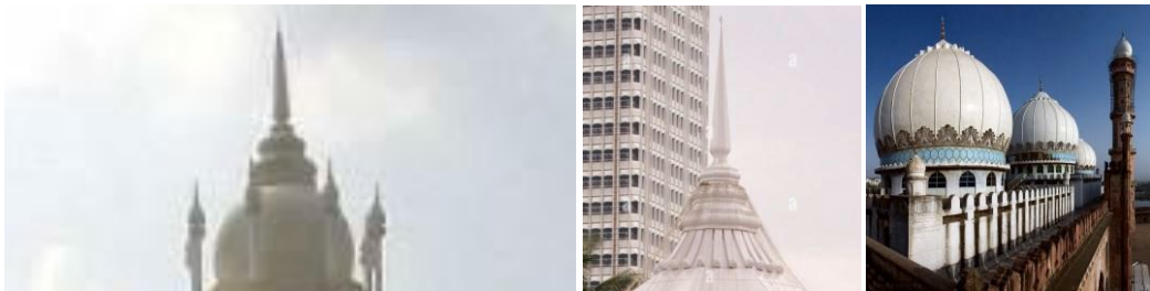
Figure 16. Mughal Finial at KTM Station Kuala Lumpur, Jamek Mosque, Kuala Lumpur and Jama Masjid in Delhi.

Within the realm of Mughal architecture, a finial serves as an ornamental architectural component, generally situated atop a dome, minaret, or other notable edifice. Finials are decorative elements that fulfill both aesthetic and utilitarian functions. Architectural elements are frequently crafted with the intention of enhancing the aesthetic appeal and magnificence of a structure, while simultaneously serving the practical function of redirecting precipitation away from the building's exterior. (Figure 16)