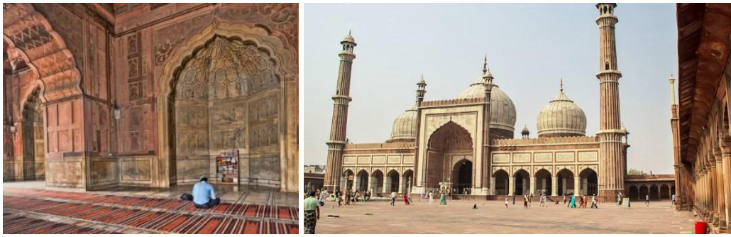
Figure 13. Double-curved shape, with a pointed or cusped top and concave curve on the inside, Jama Masjid, Delhi