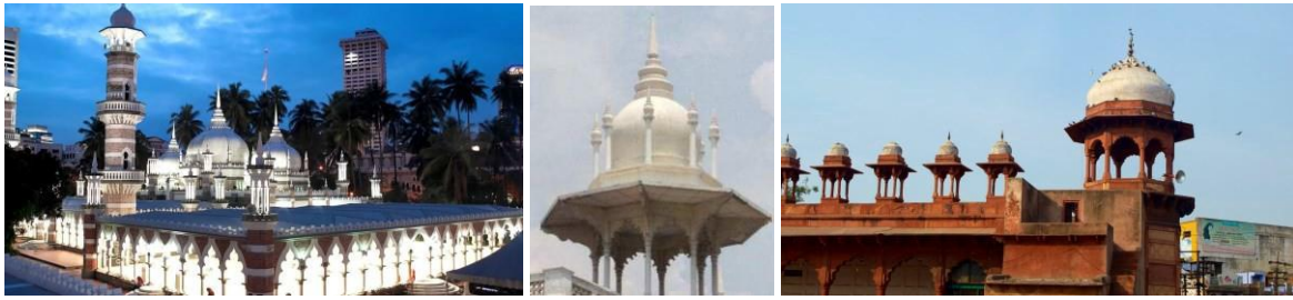
Figure 19. Chhatris at Jamek Mosque, Kuala Lumpur and KTM Station Kuala Lumpur and Jama Masjid in Delhi