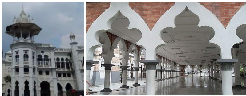
Figure 14. Pointed Mughal arches dominated along the colonnaded corridor of the building at Kuala Lumpur Railway Station Buildings and Kuala Lumpur Jamek Mosque