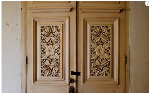
Figure 8 . Courtroom doors at Bangunan Sultan Abdul Samad, decorated with local arabesque (featuring the national flower)