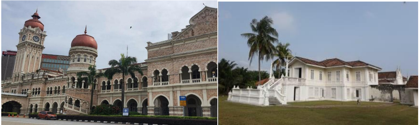
Figure 5. Color and texture of Sultan Abdul Samad Building, Kuala Lumpur and Istana Bandar Jugra, Banting