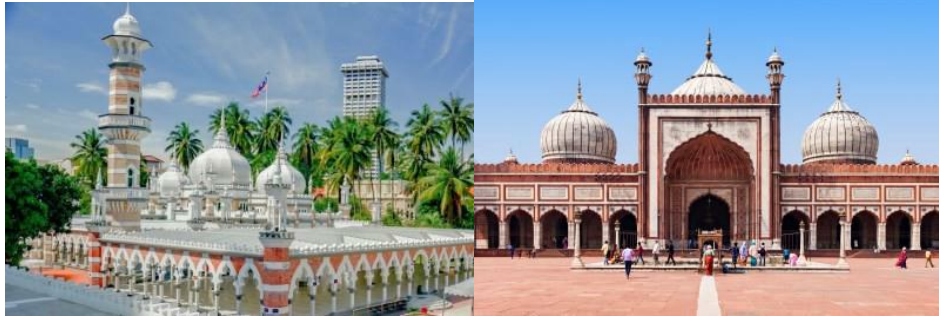
Figure 17. Mughal Dome at Jamek Mosque, Kuala Lumpur and Jama Masjid in Delhi