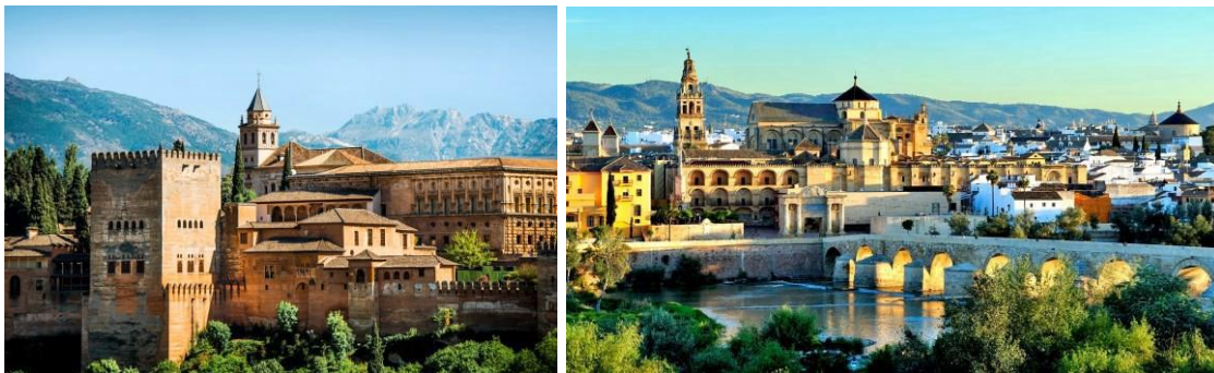
Figure 2. The Moorish Architecture (Alhambra Palace, Granada and The Great Mosque, Cordoba)

Islamic aesthetics and design principles heavily influence Moorish architecture. It echoes Islamic architectural traditions, with components such as horseshoe arches, muqarnas, dome, the central courtyard and significant use of calligraphy and vegetative design as ornamental elements. Khazae et al. (2015) and in their research paper stated that the lavish Alhambra palace and the mosques in Cordoba (Figure 2), which were constructed in the heyday of Moorish architecture between the 13th and 14th centuries, are the most well-known and notable structures that have survived to this day. Bangunan Sultan Abdul Samad, Kuala Lumpur, and the Istana Bandar Jugra (Figure 1), Selangor, have been identified as colonial structures showcasing Moorish architectural influence in a case study conducted by Khazae et al. (2015) and Utaberta et al. (2021)