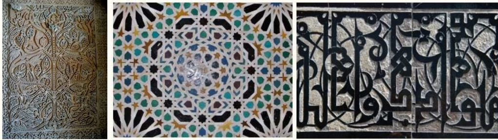
Figure 7. Example Moorish Ornamental Elements