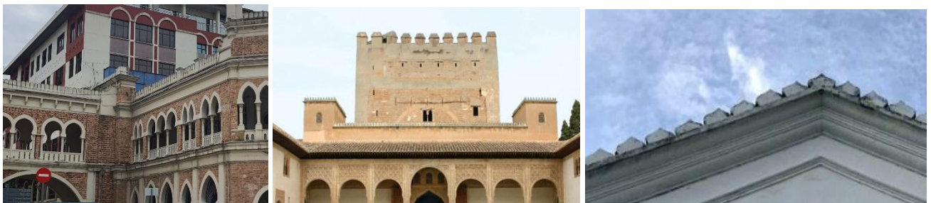
Figure 11. Crenellated rooftops for Alhambra Palace Granada, Sultan Abdul Samad Building, Kuala Lumpur and Istana Bandar Jugra, Banting.