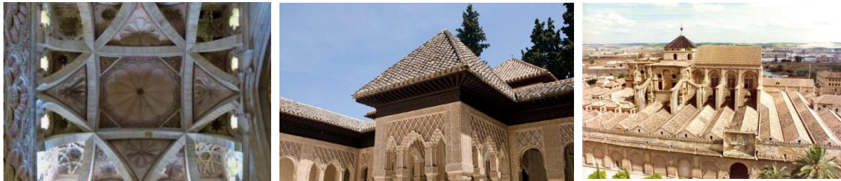
Figure 10. Example of Ribbed Dome and Roof design of Al Hambra Palace, Granada and The Great Mosque, Cordoba