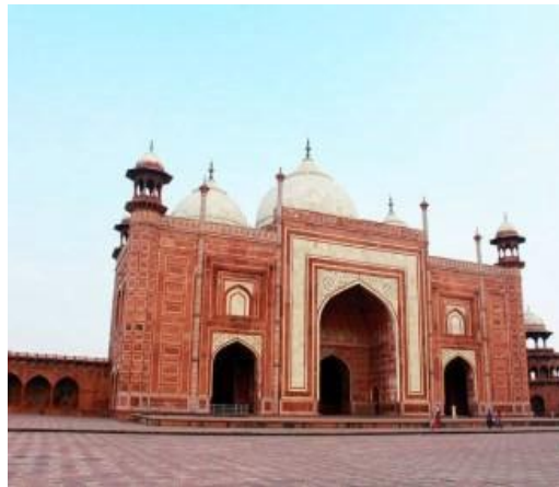
Figure 12. The Jama Masjid, Delhi

style represents a synthesis of Islamic, Persian, and Indian architectural components and is renowned for its opulence, balance, and incorporation of elaborate ornamental features. Several notable characteristics may be identified within Mughal architecture that are worth mentioning. The Jama Masjid in Delhi, according to Khazaee et al. (2015) in their research paper, is the best mosque of Mughal architecture. The Jama Masjid, Delhi, which the Emperor Shah Jahan had constructed during the Mughal era, is a prime example of a masterpiece of Mughal architecture, displaying the complex features and opulence that characterize the era's architectural style. (Figure 12)