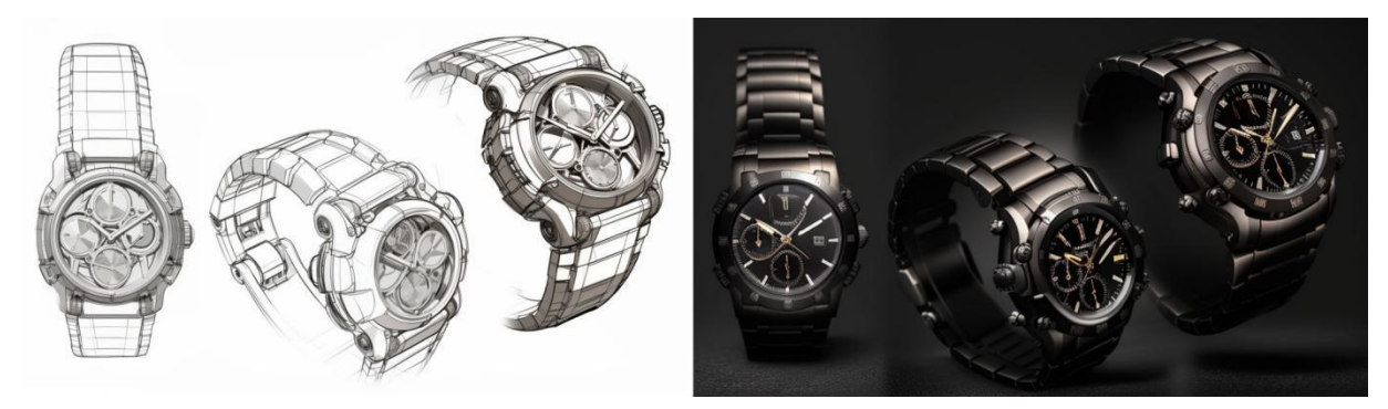
Fig (4): 3D rendering of product design generated by Mid journey (Self-Drawing)

engendering a gestalt that resonates harmoniously with the aspired stylistic ethos. In the context of a wristwatch design, adroit keyword articulation encompassing facets such as material composition, chromatic tonality, design ethos, illumination orchestration, and analogous parameters instantaneously conduce to the manifestation of a superlative tridimensional portrayal of the envisioned product, characterized by its fidelity to aesthetics and contextual precision.