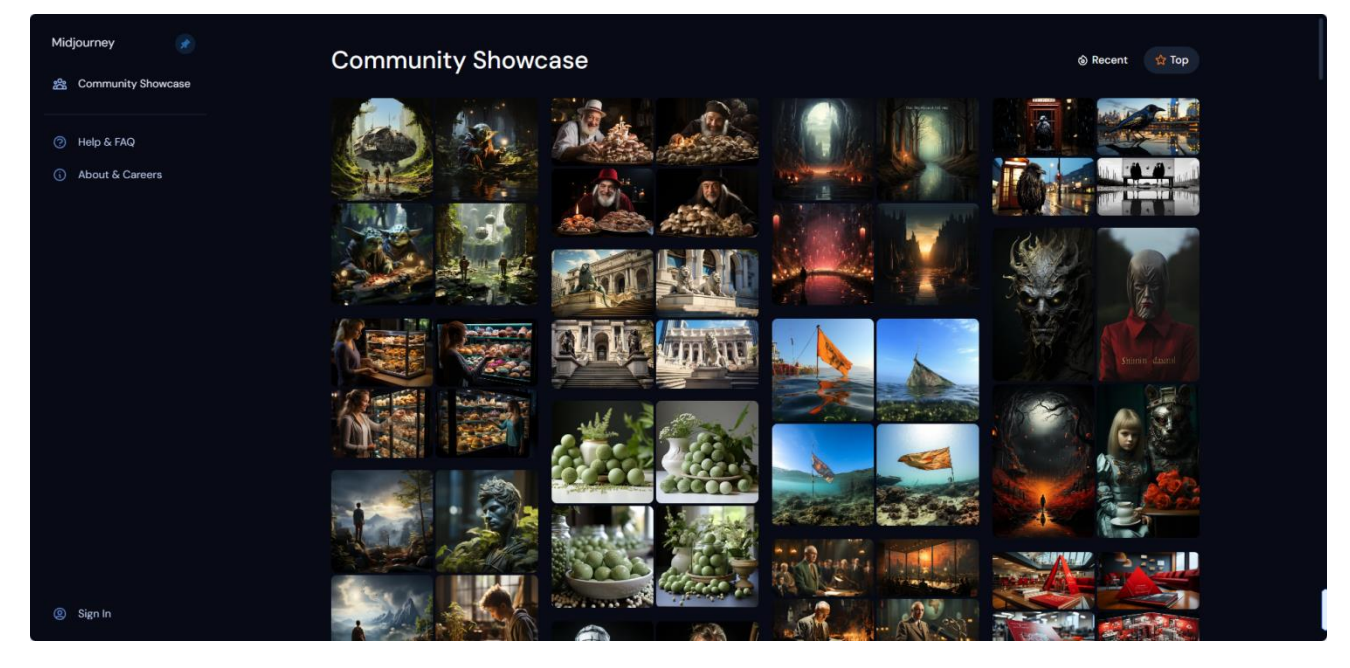
Fig (2): From Mid journey official website

Mid journey, developed by a research laboratory of the same name, entered the public testing phase on July 12, 2022. This AI painting tool possesses the capability to generate corresponding images based on user-input text descriptions, achieved through the utilization of Generative Adversarial Network (GAN) technology for text-to-image transformation. With vast application potential in artistic creation, game development, film effects, and beyond, Mid journey symbolizes the continual breakthroughs and innovations of artificial intelligence technology in the realms of image processing and creativity. Users can engage Mid journey by transmitting messages to a bot within the Discord chat application, circumventing the need for programming. The laboratory behind Mid journey is spearheaded by David Holz, one of the founders of Leap Motion, and is dedicated to the development of AI tools capable of emulating human creativity.