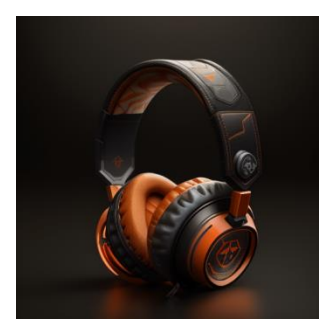
Fig (5): 3D rendering of the effect of different materials in the same product by Stable Diffusion (Self-Drawing)