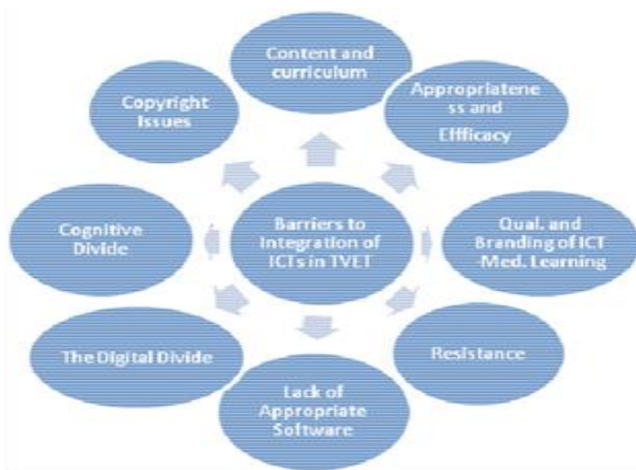
Figure 2: Barriers to effective integration of ICTs in TVET.

It is pertinent by the implication of the afore quote for TVET institutions to acknowledge the reality that information age necessitates, and to device a confrontation